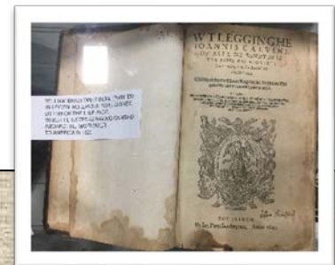
Bradford Family Bible